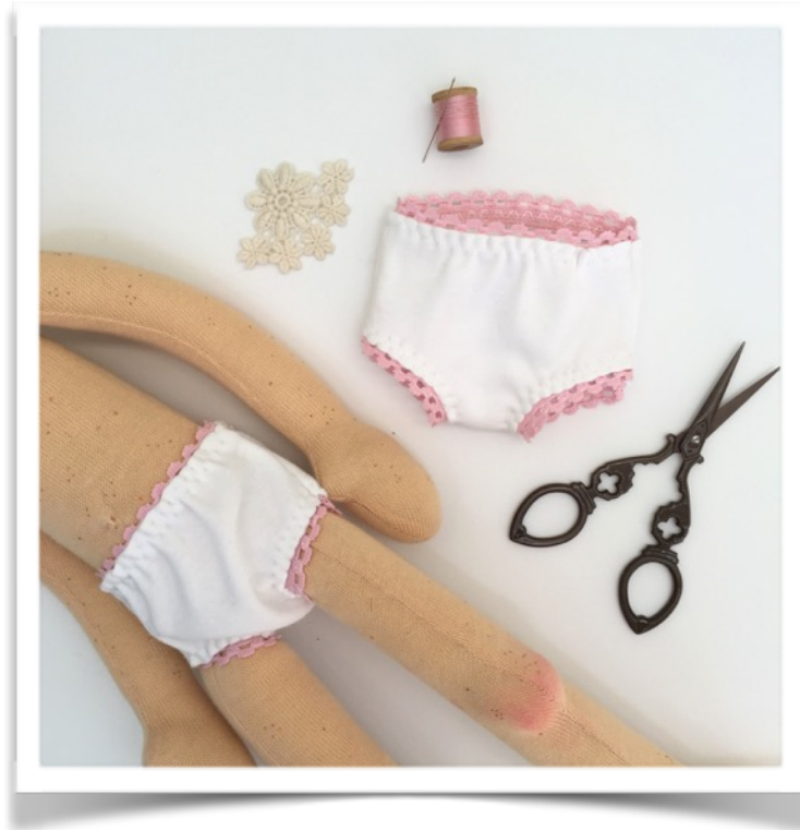
FIG & ME DOLL UNDIES in two sizes: little & big